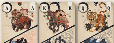
Example Run of A, K, Q