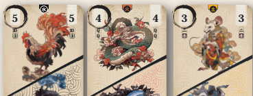
Example Run of 5, 4, 3

A Run consists of 2 to 5 consecutive values, whereby the “二” may not be part of a Run. Examples: 5, 4, 3 or A, K, Q.