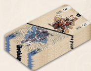
Previously played cards, to discard