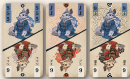
You now have 3 Animal cards with Blue sides up in your hand.