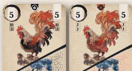
Example Set of 5, 5

A Set consists of 2 or more identical values . Examples: 5, 5 or 7, 7, 7