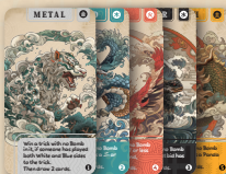
5 Element cards