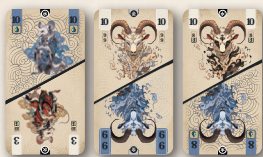
At least 1 Blue side is played, without winning the trick