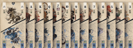
65 Animal cards (13 cards each in 5 suits)