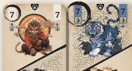
Example Set of 7, 7, 7, with one Water used as a 7