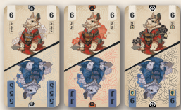
Cards with White sides are played, without winning the trick